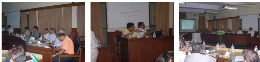
Table 62: Team Composition for Visioning Workshop